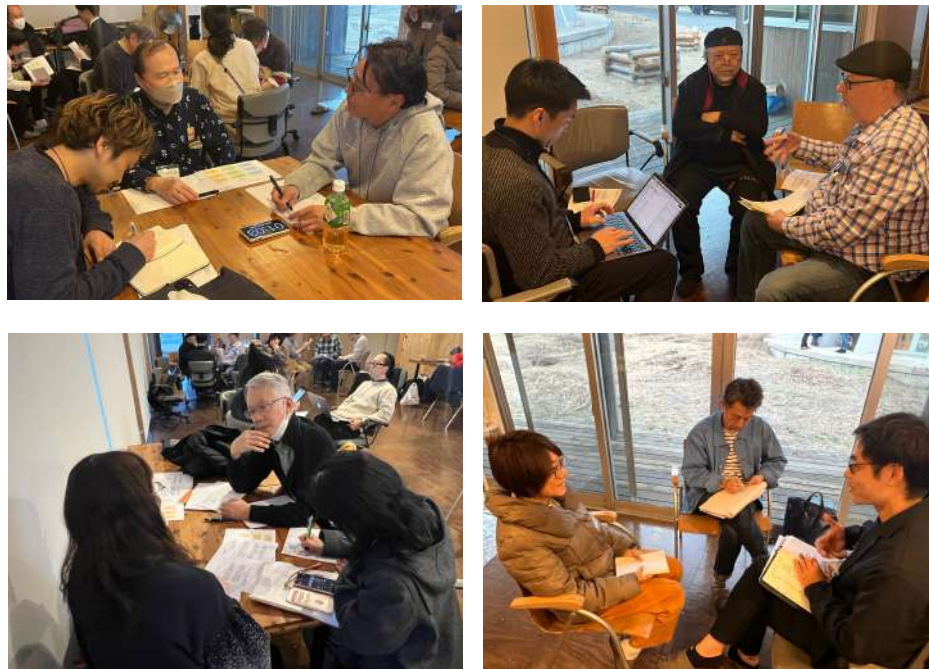
Figure 3: Role-Playing as interviewer and interviewee in Teams of Three