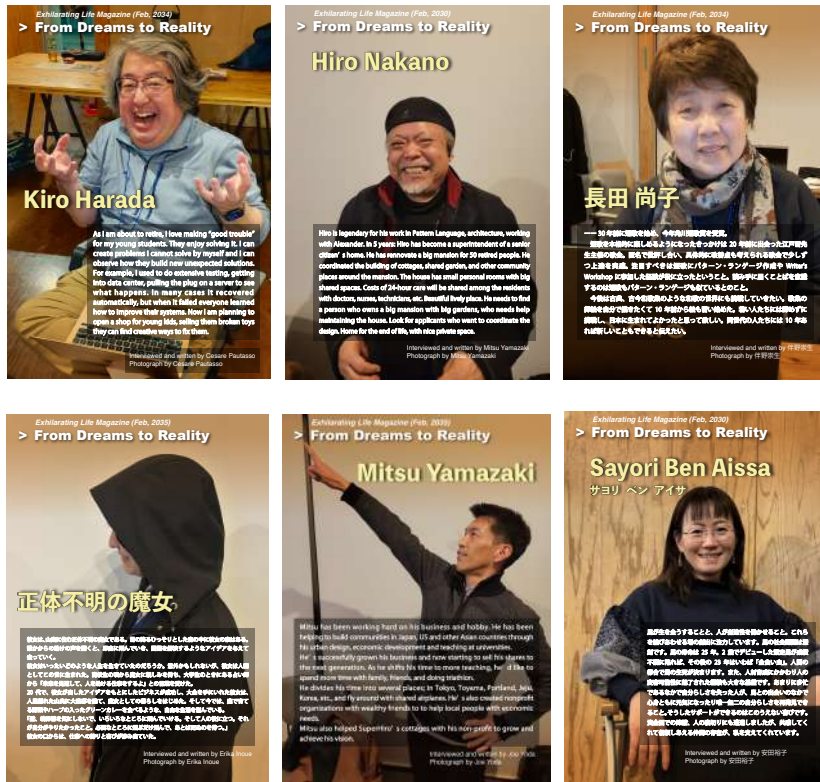
Figure 4: Created Magazine-Style Articles