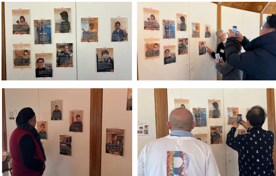
Figure 5: Display of the Articles