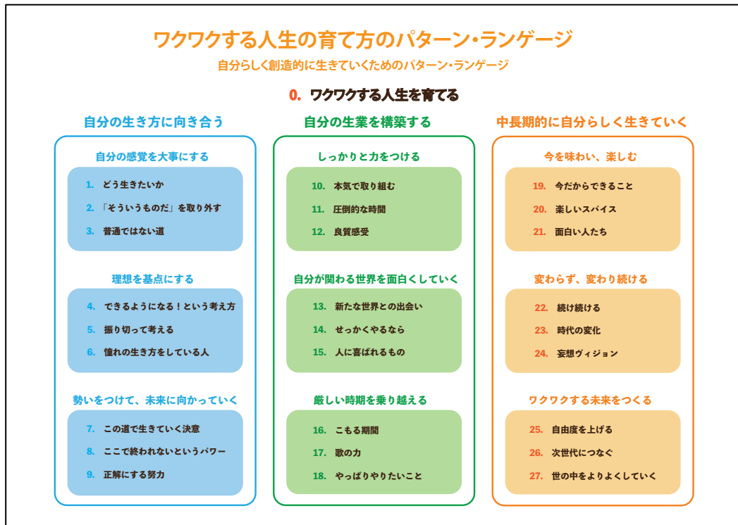
Figure 2: Overview of “A Pattern Language for Nurturing an Exciting Life” in Japanese