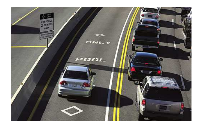
Figure 1: The car pool lane is for cars with multiple passengers

• Sender. The sender packs multiple messages together into a single packet. It must ensure that they are