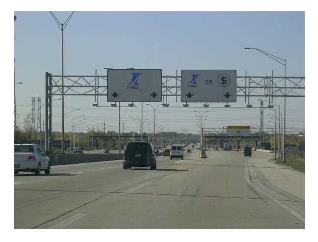
Figure 6: Drivers with special transmitters can pay tolls without stopping (i.e. breaking the connection)

ability to send multiple requests without waiting for responses to previous requests.