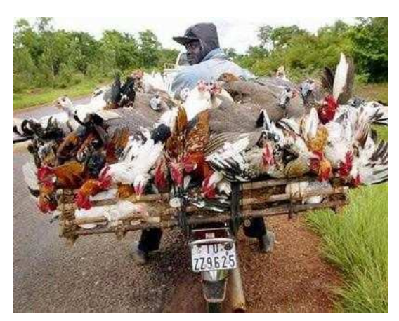
Figure 9: Compressed "data"

Popular data formats, such as XML and plain text can be compressed very effectively. For example, one military study [24] has found that XMill hybrid compression can reduce the size of large XML documents to 1% of the original size.