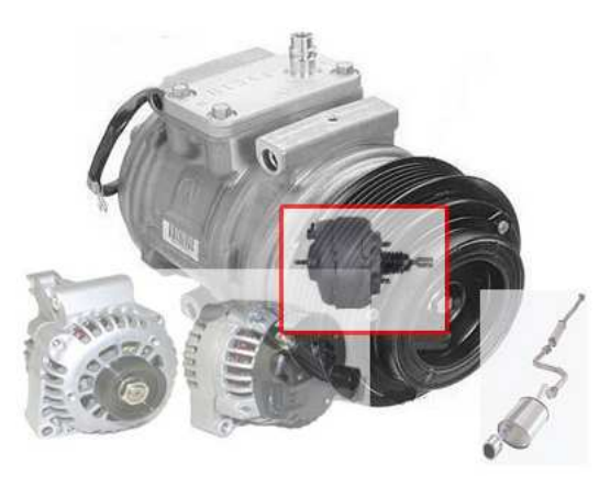
Figure 10: Sometimes replacement parts are enough

Unlike Data Compression (7), effective use of delta encoding requires custom implementation of the encoding for all, but the most typical data types.