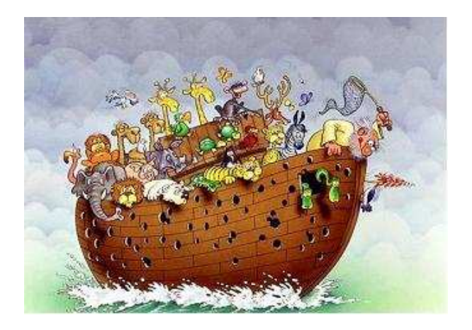
Figure 3: As in Noah's ark, Message Dispatcher has only one instance of each data type (male and female are different).

Implementing the Message Dispatcher pattern requires adding the receiver and sender Message Dispatchers, and defining new message structure.