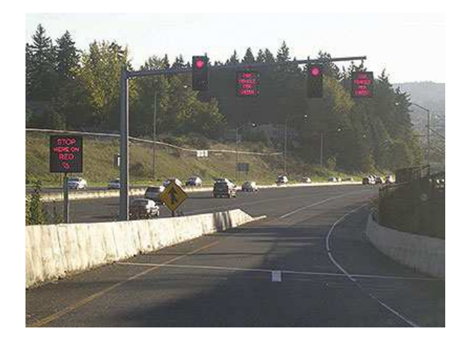
Figure 8: The expressway self-throttles its traffic by limiting the number of entering vehicles. Drivers often ignore this red light thus overriding the expressway's setting.

Keep the history of previous attempts to be able to better predict whether or not to throttle sending a specific message type in the future. Have the application choose transmit times based on the existing conditions and imposed guidelines. Enable the user to override the application's decision procedure.