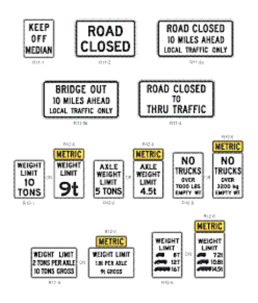
Figure 5: Traffic signs: conditions that limit traffic

First analyze the negotiation protocol. Identify typical exchanges between the sender and each receiver. Try to shorten the most popular exchanges to one message exchange by including all relevant data in the initial request.