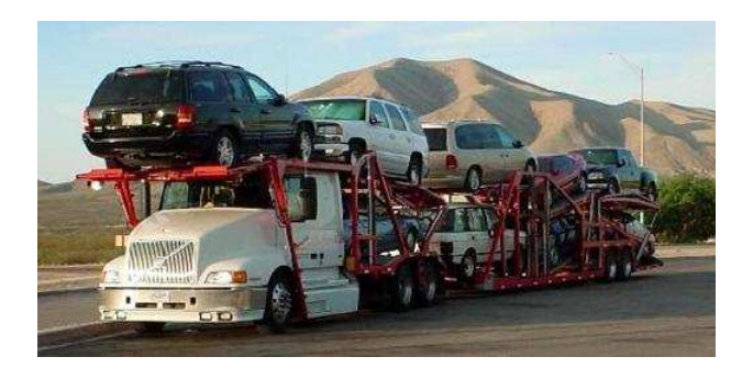
Figure 7: Cars piggyback on the truck.

• Message Structure. Messages intended for a single receiver may contain any number of unrelated data elements in addition to the ongoing conversation data.