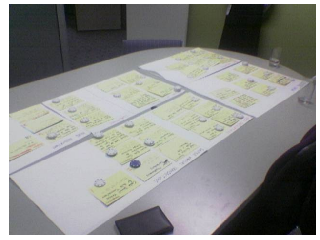
Figure 3: After chip placement

Physical tokens, such as poker chips, provide a more visceral experience to planning. Planning becomes something that engages the senses. The sense of texture from holding a clay poker chip, the distinct click of placing a chip on a story card, all these things are very effective in changing the presence of an otherwise mundane activity. When you see stakeholders start playing with the chips while deciding which story to select next, you realise how much the experience has been changed.