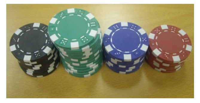
Figure 1: Emotionally engaging physical tokens

When engaging in Release Planning, use emotionally engaging physical tokens to represent points that can be allocated to user stories.