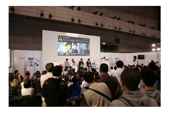
Figure 4: The venue of NicoNico Chokaigi.

Solution: Let's hold a symposium in a special venue. There are some special venues that have special values for Japanese Internet users. In Japan, there are "Nicofarre" and "NicoNico Chokaigi".