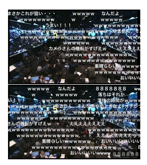
Figure 2: Comments are flow over the live broadcasted sceen from right to left.